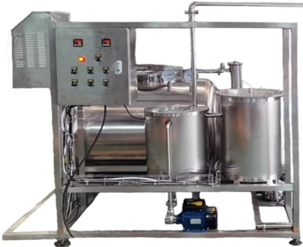
CES Ozonated Water for 60s